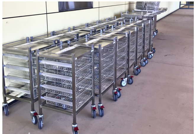
Sunshine Coast University Hospital