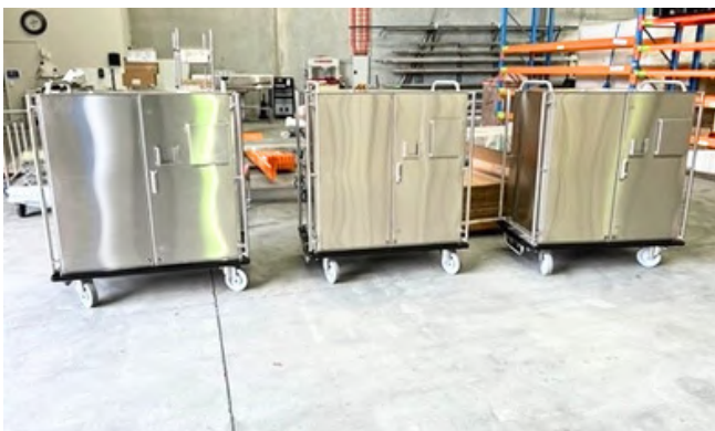
Transport Trolleys for Mercy Hospital Auckland (NZ)