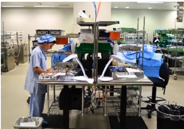
Gold Coast University Hospital – CSD SP537 Wrap Stations