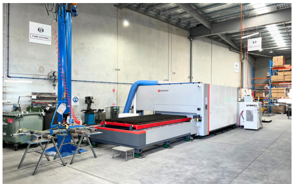
Fibre Sheet/Tube Laser Machine