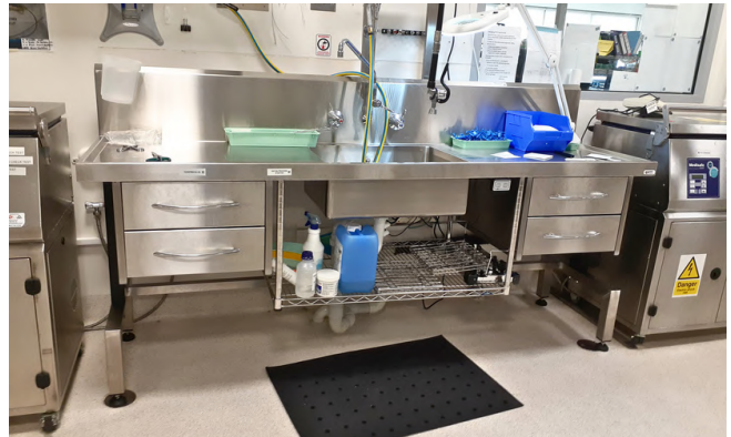
Port Macquarie CSD