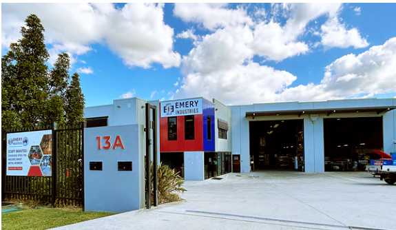
The front of our new factory

Committed to environmental stewardship, we've implemented a full solar solution and upgraded to LED lighting, greatly reducing our carbon footprint. We are actively working towards ISO14001 Environmental certification, complementing our ISO9001 Quality Management certification, underscoring our dedication to sustainable operations. This holistic approach to manufacturing excellence and environmental responsibility highlights Emery Industries' journey towards a greener future and our continuous pursuit of operational excellence.