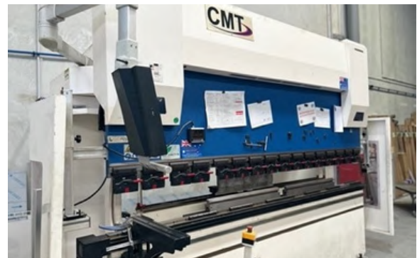
5 axis CNC Press Break