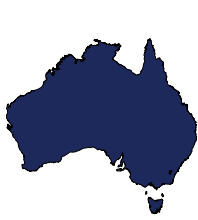
Australia (all states)