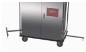
SP397.3 Tow Hitch Bar