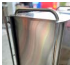
AO-PH Push Handle