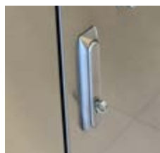
Tamper Proof Eyelet